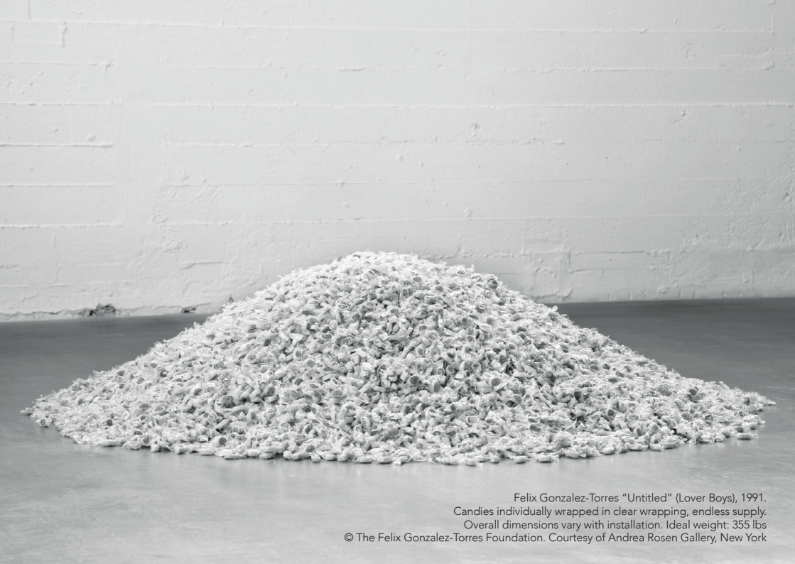
Felix Gonzalez-Torres "Untitled" (Lover Boys), 1991. Candies individually wrapped in clear wrapping, endless supply. Overall dimensions vary with installation. Ideal weight: 355 lbs © The Felix Gonzalez-Torres Foundation. Courtesy of Andrea Rosen Gallery, New York